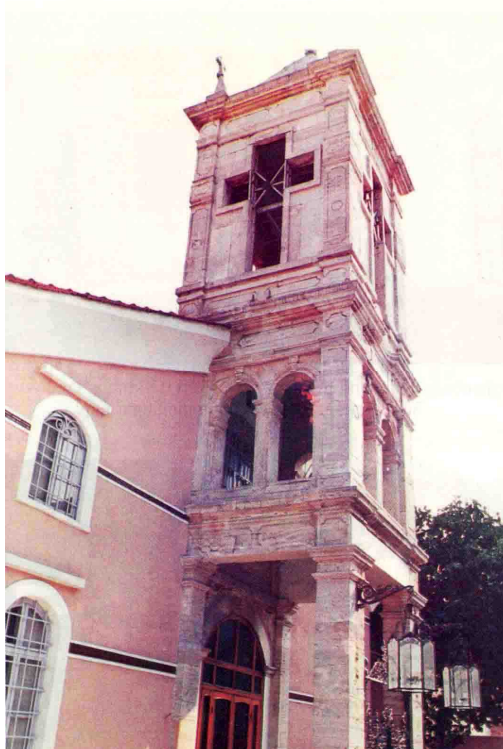
Armenian St. Asdvadzadzin Mother Church (1828), adjacent to the Patriarchate of Constantinople

At the present 18 schools function in Istanbul, of which 5 lyceums: the Central Lyceum in Ghalatia, the Yessayan Lyceum in Taxim, the St. Cross Lyceum in Scutar (formerly Dbrevank), the Sahakian-Nunian Lyceum in Samatia and the Viennese Mekhitarist Lyceum in Pangalti. Worthy of remembrance are the Bezjian Main School in Kumkapu, the Dadian School in Makreköy, the Merametjjan School in Feriköy, the Aramian-Oundjian School in Kadıköy, the Levon Vartouhian School in Topkapu, the Tarkmanchats School in Ortaköy, the St. Sahak-St. Mesrob School in Yeşilköy, the Nersesian-Yermonian School in Scutar, the Semerjian Academy, the Immaculate Conception Schools in Samatia and Pangalti, the Venetian Mekhitarist School in Bomonti and lastly the Kalfayan-Karageuzian orphanages.