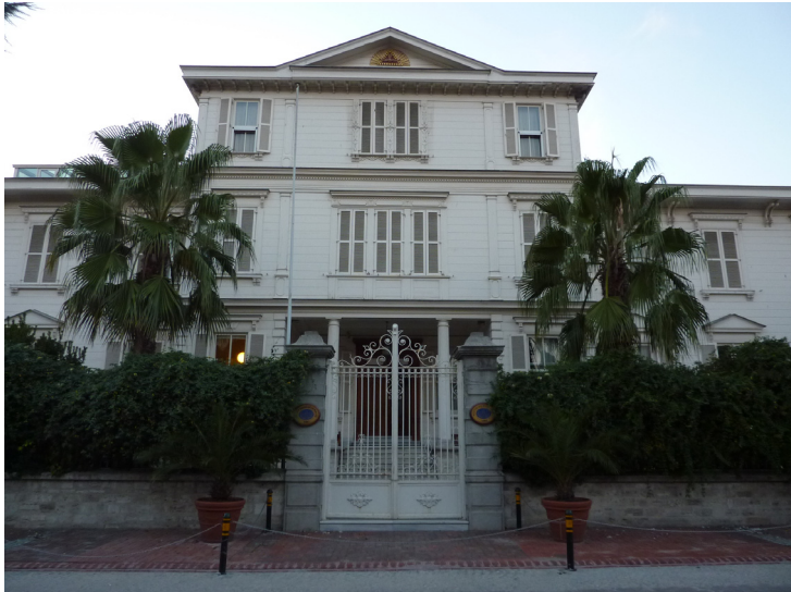
The Armenian Patriarchate of Constantinople

The trusteeships, which are elected for a period of four years, manage and support the general communal institutions, such as the National Hospital Soorp Prkich and the Karageuzian orphanage. The trusteeships are assisted by the Women's and Youth auxiliary commissions.