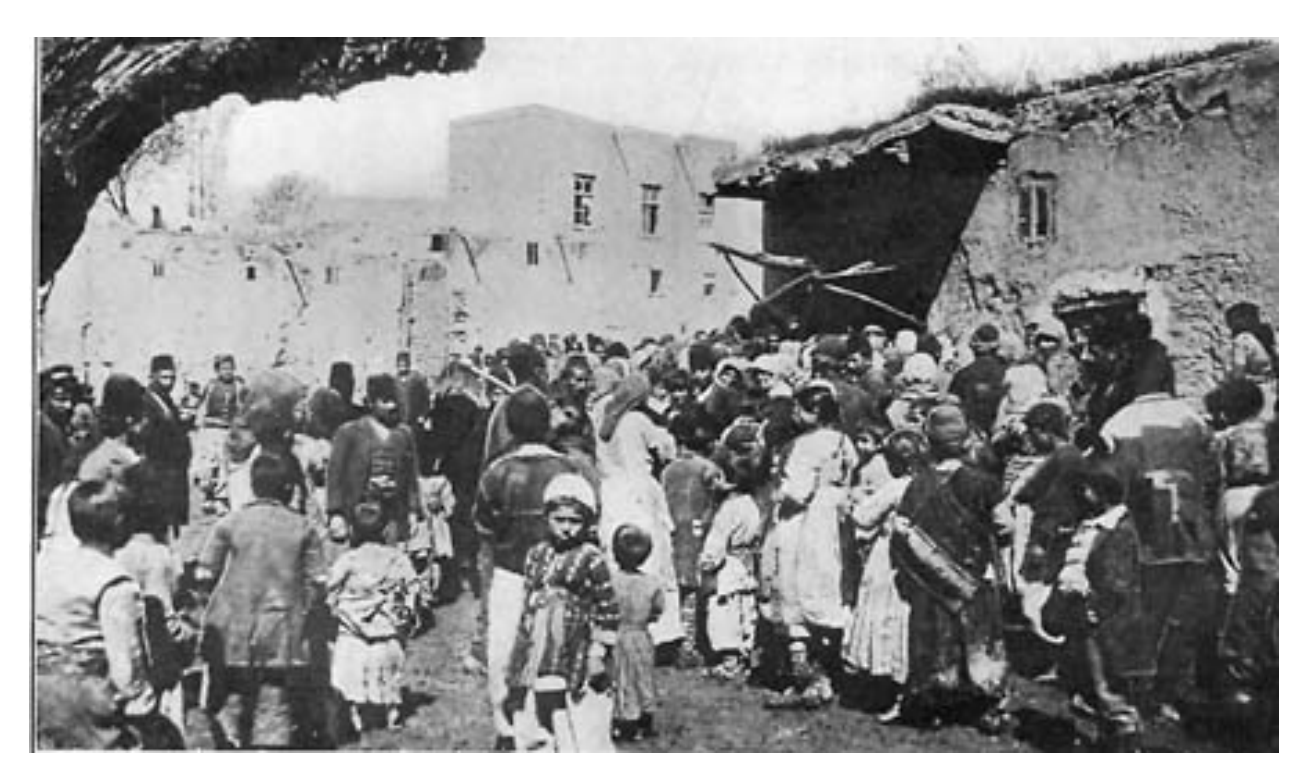
Refugees at Van crowding around a public oven, hoping to get bread. These people were torn from their homes almost without warning, and started toward the desert. Thousands of children and women as well as men died.

This is how Morgenthau represents the murder of Armenian young people: "On April 15<sup>th</sup>, about 500 young Armenian men of Akantz were mustered to hear an order of the Sultan; at sunset they were marched outside the town and every man shot in cold blood. This procedure was repeated in about eighty Armenian villages in the district north of Lake Van, and in three days 24,000 Armenians were murdered in this atrocious fashion"<sup>22</sup>.