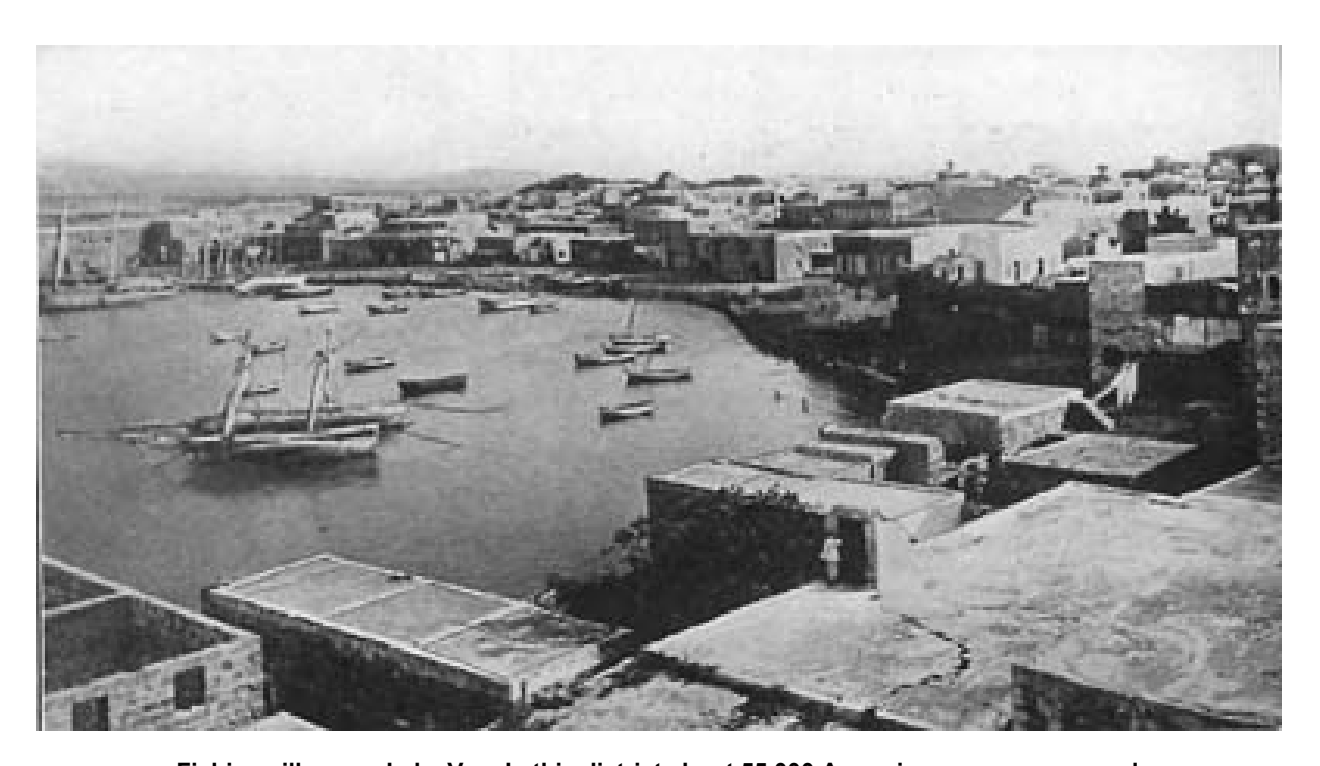
Fishing village on Lake Van. In this district about 55,000 Armenians were massacred.

In 1890-s the Turkish government was supported by Imperial Germany. In 1898 Emperor Wilhelm II arrived in Constantinople and encouraged Hamidian slaughter policy. World War I gave an opportunity "to make Turkey exclusively the country of the Turks"<sup>20</sup>.