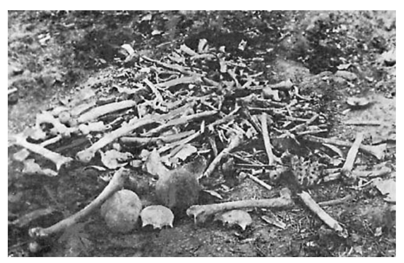
A relic of the Armenian massacres at Erznka (Erzingan)

The real intentions of the Turkish government are shown and codemned in the following lines of Morgenthau's Story: "It is absurd for the Turkish Government to assert that it ever seriously intended to "deport the Armenians to new homes"; the treatment which was given the convoys clearly shows that extermination was the real purpose of Enver and Talaat"<sup>28</sup>.