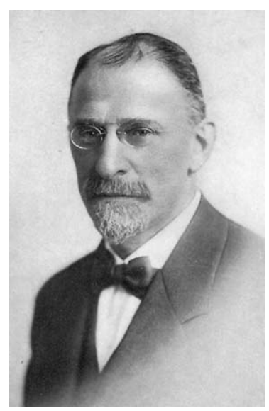
HENRY MORGENTHAU The United States Ambassador to the Ottoman Empire from 1913 to 1916<sup>2</sup>.

Humanity entered the 20<sup>th</sup> century with great achievements. The progress of science and technology was accompanied by the innovations in economy, in everyday life and in other spheres as well. Mankind reached the new level of development in the terms of civilization. The progress was evident also in the fields of education and culture<sup>3</sup>.