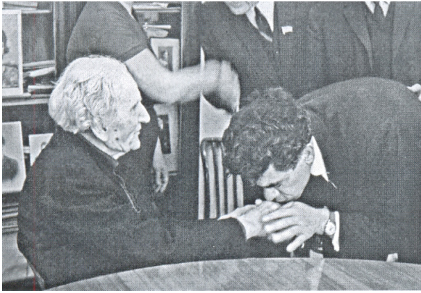
An expression of filial love towards the genius of Saryan, 1970