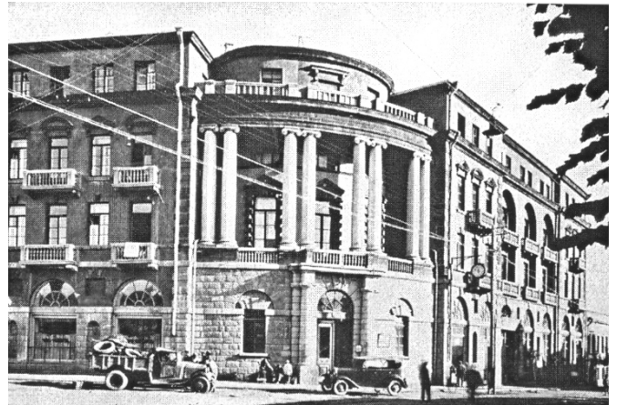
The favorite hangout of the heroes of the book – Yerevan hotel “Intourist”