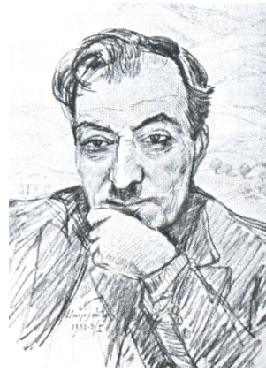
Avetik Isahakyan, 1930, Yerevan, author of the drawing Martiros Saryan