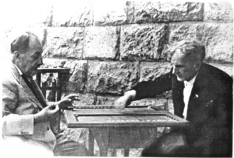
The two masters start a new “taylor” (round). Who will win?