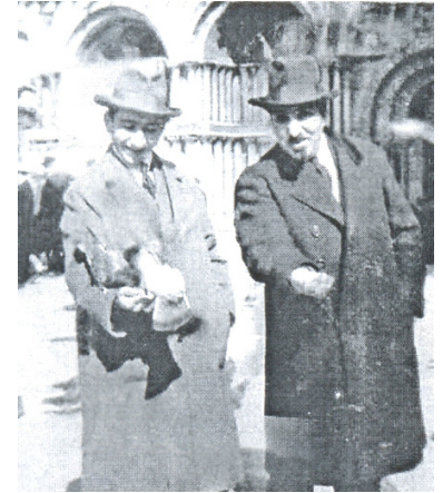
The master and Charents in St. Mark's Square, Venice, 1924