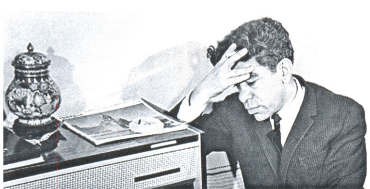
When Paruyr Sevak was with us, 1962