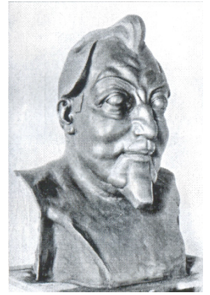
Avetik Isahakyan, Venice, 1923, author Yervand Kochar