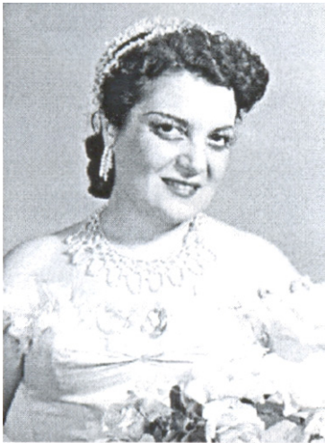
“Armenia’s nightingale” Gohar Gasparyan