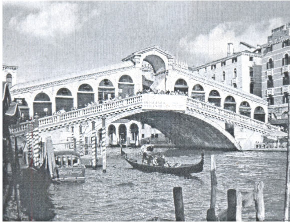
The Rialto bridge of Venice sung by Isahakyan