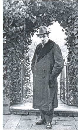
Avetik Isahakyan in the garden of his house in Venice at the address of Dorsoduro 2266, 1926