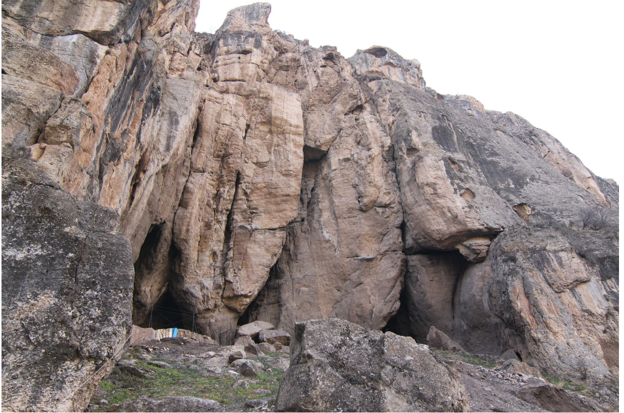
Areni-1 cave (in the east of the Armenian Highland, Syunik Mountains, Vayots Dzor province/marz). Several cultural layers (the earliest relates to the 6 th -5 th millennia BC and the latest to the 12 th -14 th cc. AD) have been discovered here by the archaeologists. The most important finds are the world's oldest (more than 6000-year-old) winery, the desiccated remains of human brain tissue, 5,500-year-old leather shoe and a fragment of reed skirt, etc.