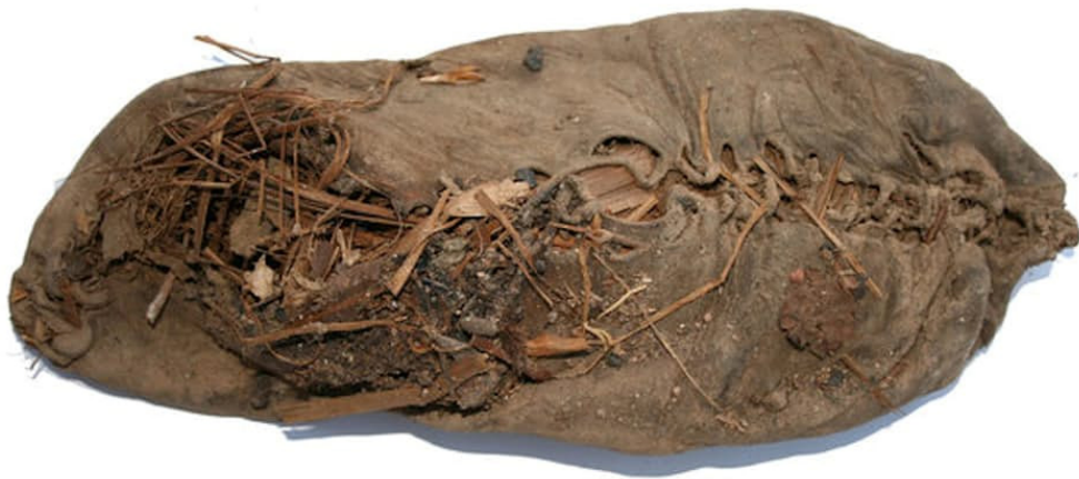
Areni-1 cave, 5,500-year-old leather shoe