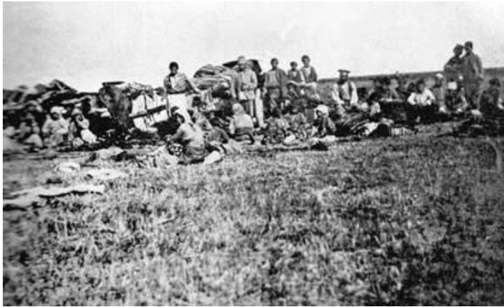
Armenian refugees retreating from Van-Vaspurakan