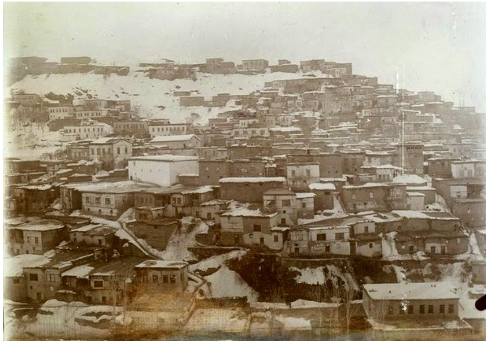
A quarter of the town of Mush in Taron, Western Armenia

During January 1916 T. Nazarbekyan's military units carried out enhanced intelligence which became difficult due to the continuous heavy snowfall. They learnt from a captive Kurd that the enemy was retreating. General Nazarbekyan's forces managed to occupy Khnus. The Armenian volunteers also directly participated in the attack.