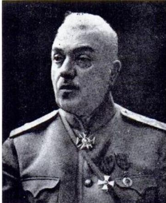
Lieutenant-general Tovmas Hovhannes Nazarbekyan

Lieutenant-general Tovmas Hovhannes Nazarbekyan (Foma Ivan Nazarbekov) (1855-1931) is one of those rare military men who participated in several wars: 1877-1878 Russian-Turkish, 1904-1905 Russian-Japanese 2 , during WWI Russian-Turkish, 1918 February-June Armenian-Turkish, then in 1918 December Armenian-Georgian, 1919-1920 Armenian-Tatar 1 , 1920 autumn Armenian-Turkish military operations.