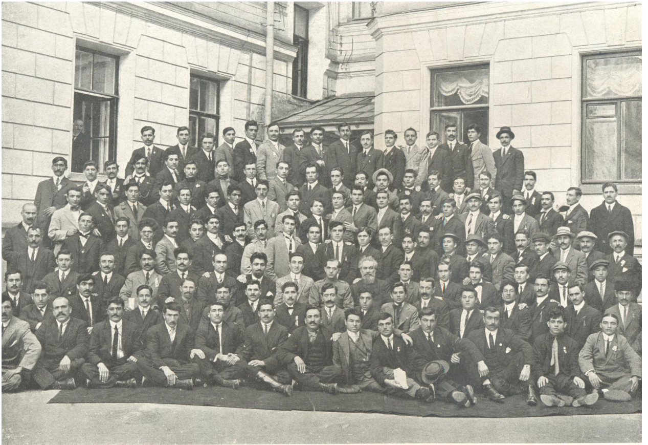
Armenian volunteers that arrived from the USA in Petrograd

Ekaterinodar (Krasnodar), Akhaltsikhe, Akhalkalak and Artsakh provided the volunteers with finance and uniforms. Volunteers arrived from Bulgaria, Romania, France, the USA and other countries.