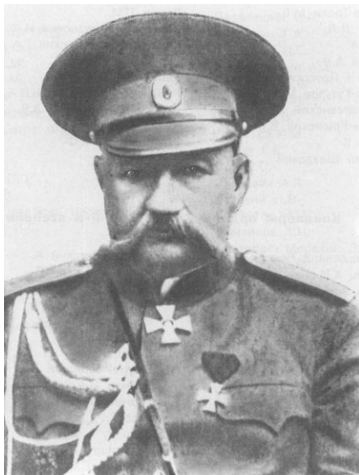
Nikolay Nikolayevich Yudenich

On July 31, 1914 Chief of Staff of the Caucasian Army, General Nikolay N. Yudenich announced the decree of Nicholas II, which stated the need to recruit volunteers. The authorities began to form units consisting of volunteers and militias - representatives of the population of the Caucasus Viceroyalty. Even before the outbreak of war Russian diplomacy intended to arm and involve the Christians living in the north-west of Persia against the Turks 14 .