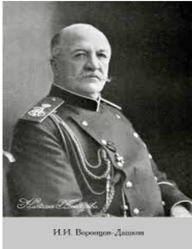
Count I. I. Vorontsov-Dashkov

The MIA and the majority of political figures and statesmen of the Government and the State Duma were against the volunteer movement aiming to dissolve the volunteer units 27 , because some of the commanders and fighters of volunteer units were active participants of the Armenian liberation struggle.