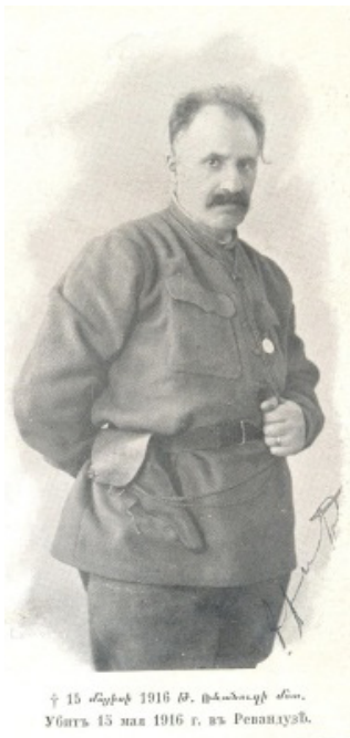
Կերի 15 մայիսի 1916 թ. Թիֆլիսի մեջ. Убитъ 15 мая 1916 г. въ Репанкузѣ.