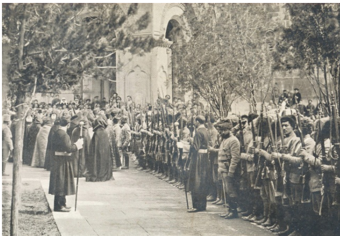
The Catholicos of all Armenians Gevorg V blesses the Armenian volunteers

During World War I the belligerents used all the material and human resources at hand to achieve victory. People's volunteer units were organized from national minorities. Such policy had been adopted also by the Russian authorities in the Caucasus Viceroyalty 1 . After Germany declared war on Russia, the Russian authorities started organizing people's local volunteer units.