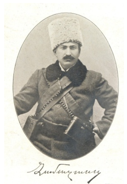
Hamazasp (Hamazasp Srvandztyan)

In the time of the battle of Sarighamish (December 22, 1914 to January 17, 1915) the 5th volunteer unit under the command of Vardan (Sargis Mehrabyan) was sent to Alexandropol. The number of volunteers in this unit was 700 people, but the unit was not armed. The decision to send the volunteer unit to