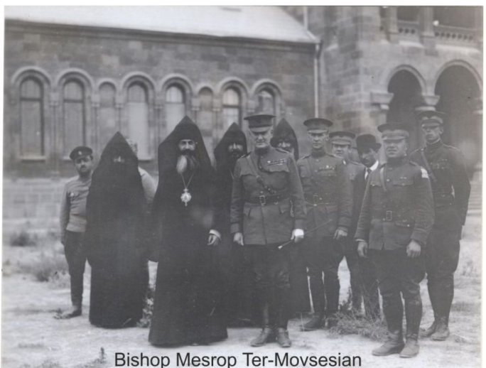
Bishop Mesrop Ter-Movsesian

September 29, 1919: the party left the camp of Tartars at 6-20 A.M. accompanied by escort of Tartars<sup>38</sup>, including their Chief. About nine miles out from their camp these guards halted and told the party to go ahead alone, at the same time the Chief requested a conference with General Harbord. Upon arrival at place where the General